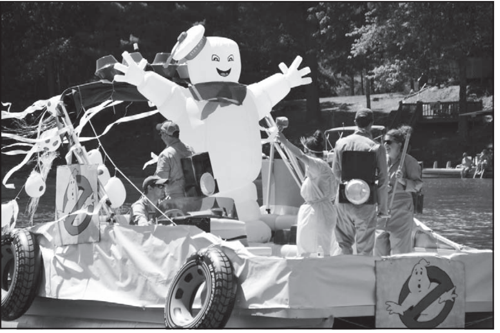
The Ghostbusters put a lot of effort into decorating their Nottely Boat Parade entry five years Photo by Lily Avery/2016